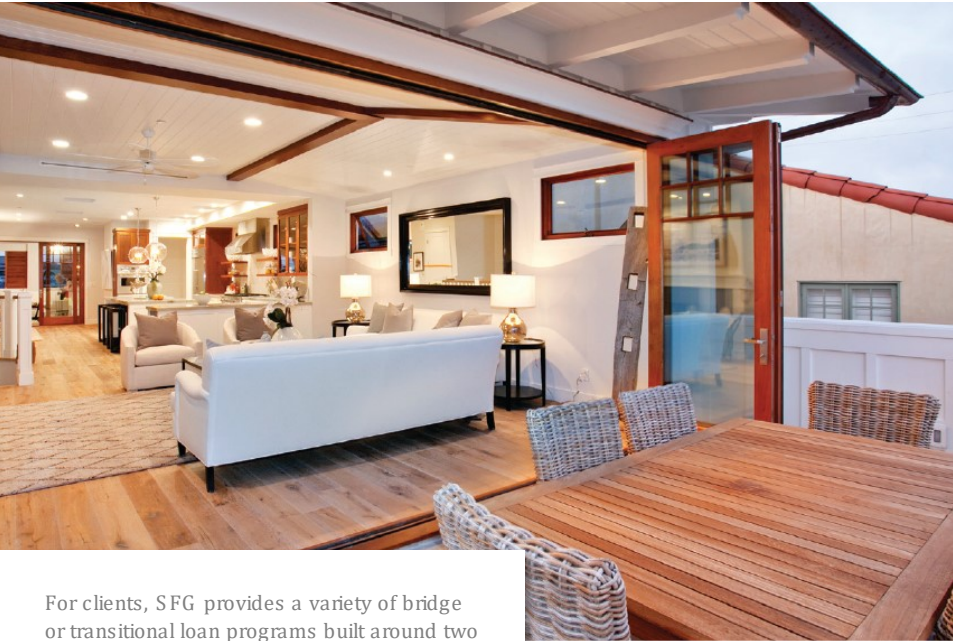
For clients, SFG provides a variety of bridge or transitional loan programs built around two primary drivers – value-add opportunities and the need for responsiveness.